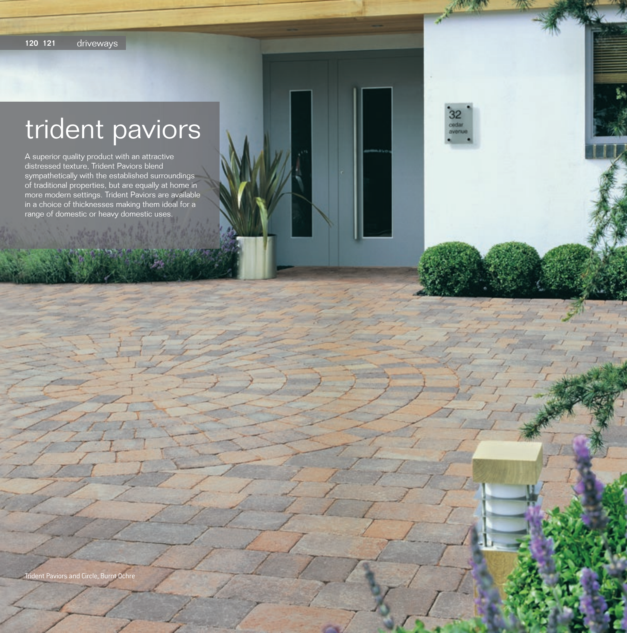
Trident Paviers and Circle, Burnt Ochre

A superior quality product with an attractive distressed texture, Trident Paviers blend sympathetically with the established surroundings of traditional properties, but are equally at home in more modern settings. Trident Paviers are available in a choice of thicknesses making them ideal for a range of domestic or heavy domestic uses.