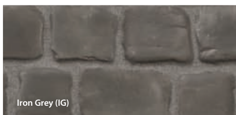
Iron Grey (IG)