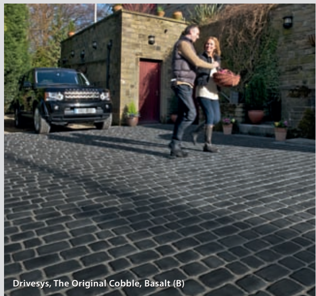
Drivesys, The Original Cobble, Basalt (B)

Marshalls recommends the patented Drivesys Driveway system is installed by Marshalls Register Installers